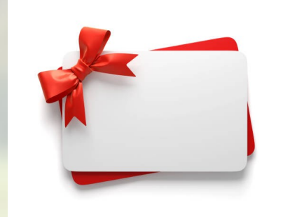
Pro-Shop Gift Card