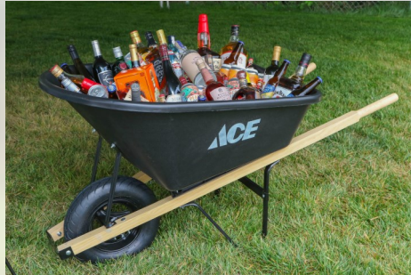
Bottle for the Booze Barrel