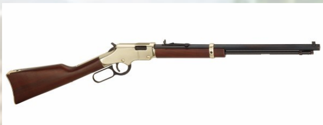
Golden Boy .22 Rifle