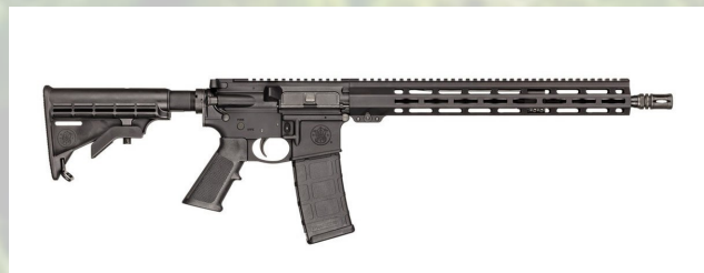
Smith & Wesson M&P Sport Rifle